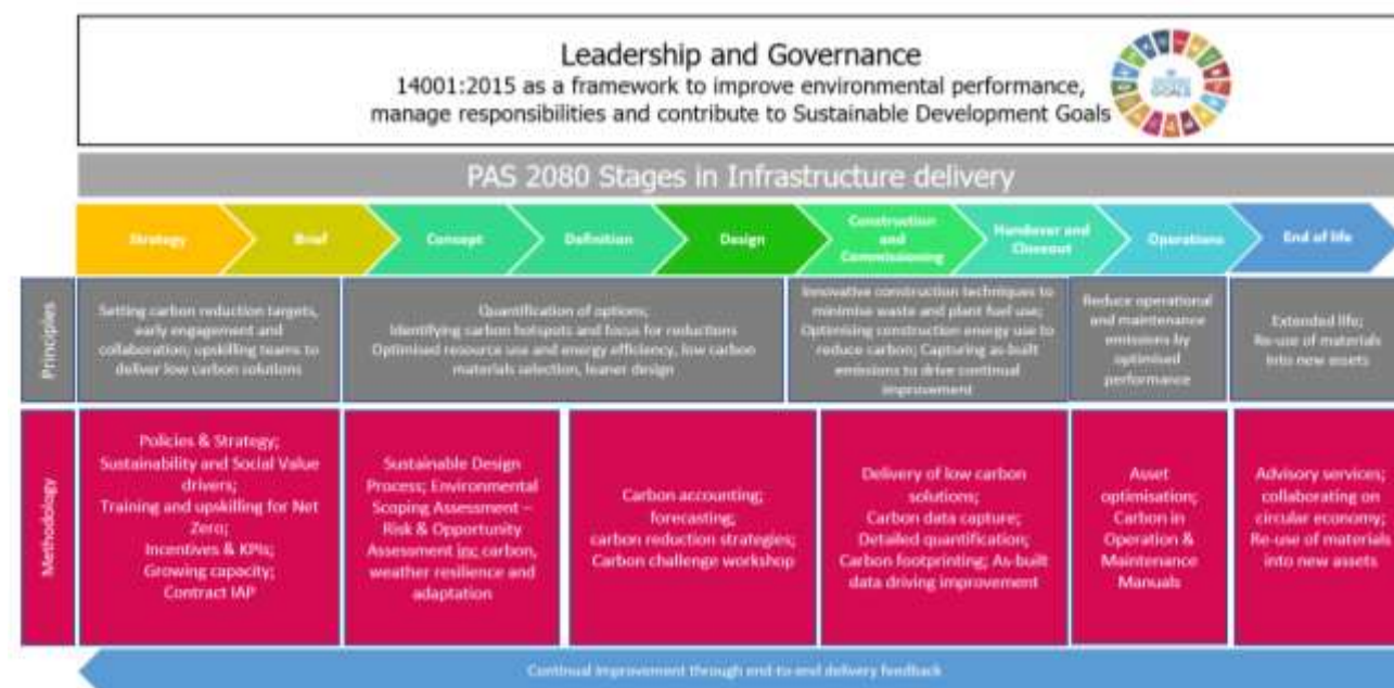
Figure 1: Our approach reduces carbon throughout the lifecycle of delivery – from strategy to end of life stages

We have adopted a lifecycle approach to reduce carbon throughout delivery see Figure 2